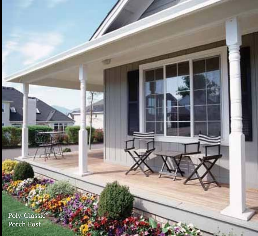
Poly-Classic® Porch Post